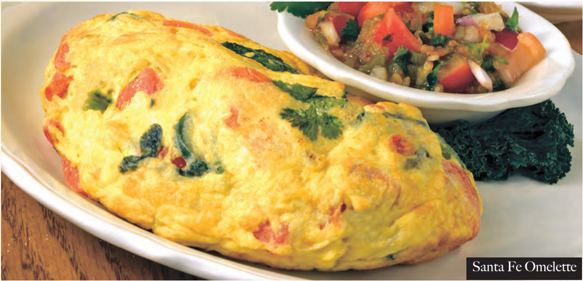
Santa Fe Omelette

Open Daily from 6:30AM-2:30PM. Breakfast and Lunch served all day. No Reservations. richardwalkers.com