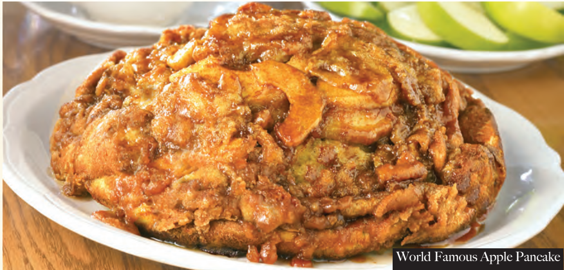
World Famous Apple Pancake